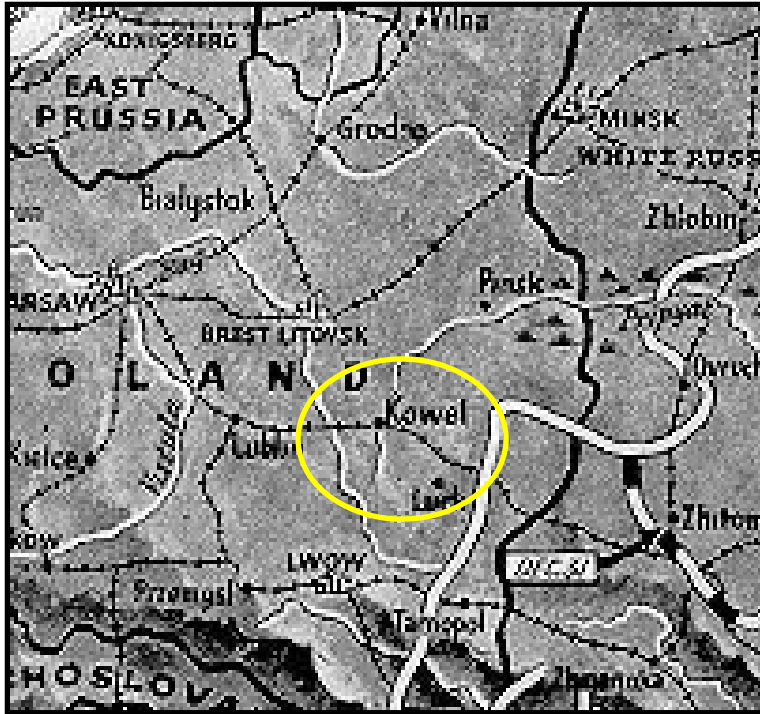
Area of Operations

Headquarters, II Battalion, SS Panzer Regiment Wiking; 8th Company, Panzer Regiment Wiking; 66th Flak Regiment